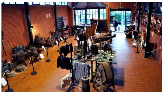
The copper museum