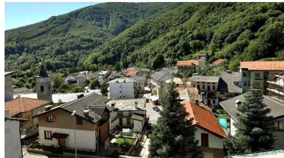
A view from above of Alpette