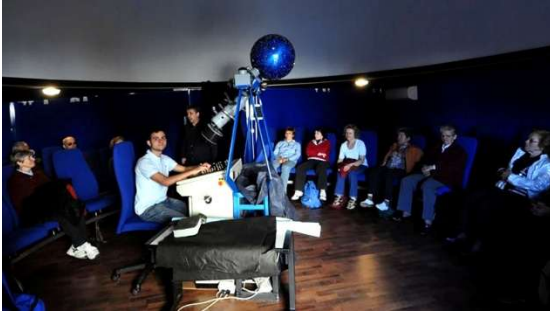
The famous Planetarium