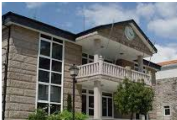
MUIÑOS TOWN HALL

Airport of Vigo -145 km (1h 35min) Airport of Santiago 156 km (1h 45min)