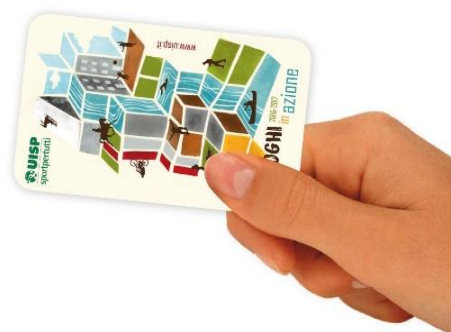
Example: ITALY, National UISP License 2017